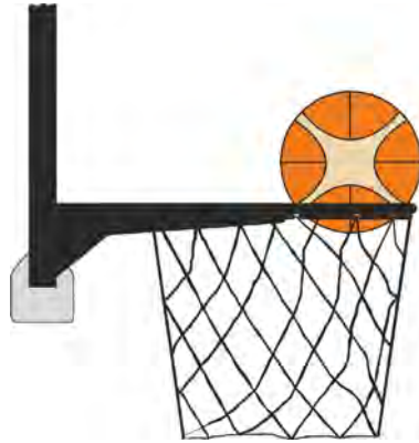
Diagram 3 Ball is within the basket

31-20 Statement. It is an interference violation if a defensive player touches the ball while the ball is within the basket.