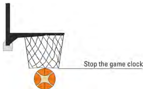
Diagram 1 A goal is made

16-10 Example: At the beginning of a quarter, team A is defending its own basket when B1 erroneously dribbles to his own basket and scores a field goal.