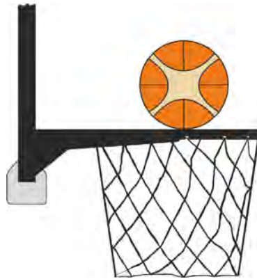
Diagram 2 Ball in contact with the ring

31-15 Statement. Interference is committed by a defensive or offensive player during a shot for a field goal when a player touches the basket or the backboard while the ball is in contact with the ring and still has a possibility to enter the basket.